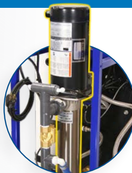
Stainless Steel Multi Stage Booster Pumps