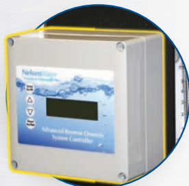
Optional - Control Box w/Low Pressure, Permeate TDS & Level Controls