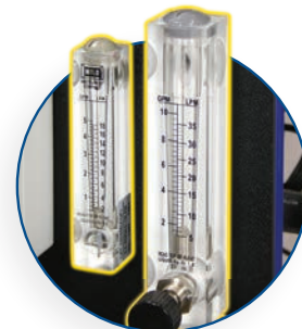
Permeate & Concentrate Flow Meters