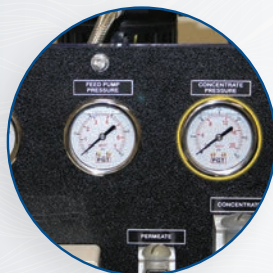
Liquid Filled Panel Mounted Concentrate Pressure Gauge