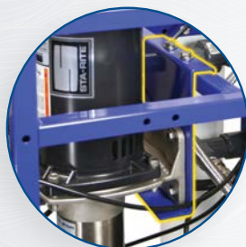
Easy Motor Mount Bracket

The NRO 440 Series is designed for Commercial or Light Industrial applications requiring flow rates of 1.1-6.9 gallons per minute (GPM). The NRO 440 Series features the durability of a powder coated steel frame, an optional complete performance monitoring package, and simple system integration.